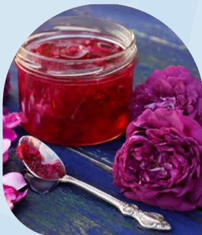
Rose Petal Jam