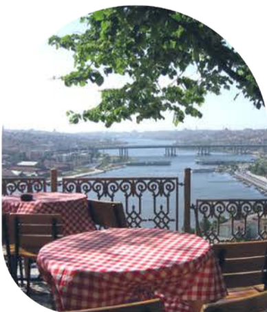
Pierre Loti Hill

At the end of the tour there is an opportunity to go shopping.