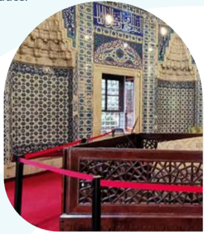
Tombs of Suleiman and Roksolana