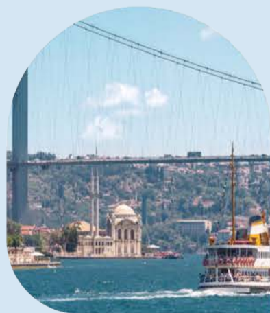
Bosphorus Boat Trip