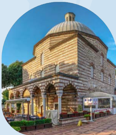
Hammam Hurrem Sultan (external view)