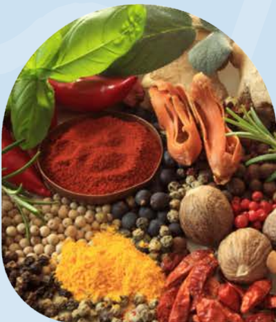
Spices and herbs