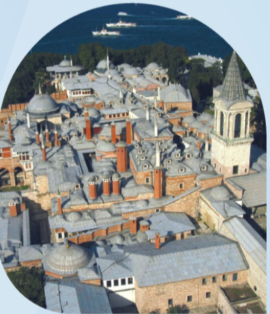
LUNCH Topkapi Palace