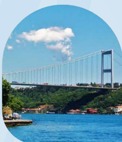
Bosphorus Bridge (view from the Bosphorus)