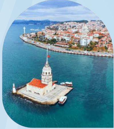
Maiden Tower (external view)