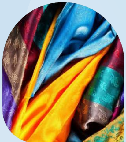
Turkish textile products