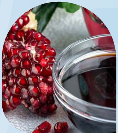
Pomegranate sauce for salads