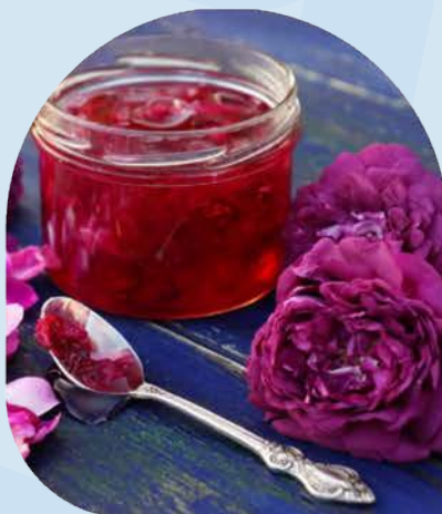
Rose Petal Jam