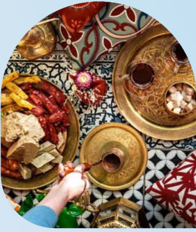
Sweets: Turkish delight, baklava