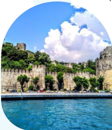
Rumeli Fortress (view from the Bosphorus)

At the end of the tour there is an opportunity to go shopping.