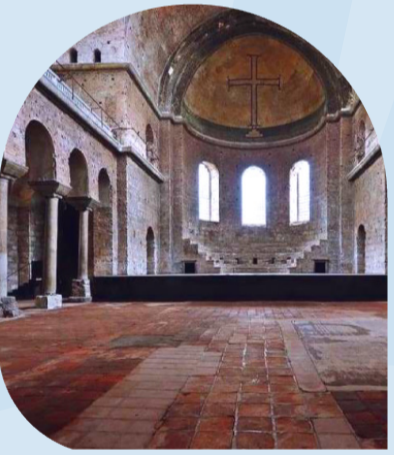
Palace of Saint Irene