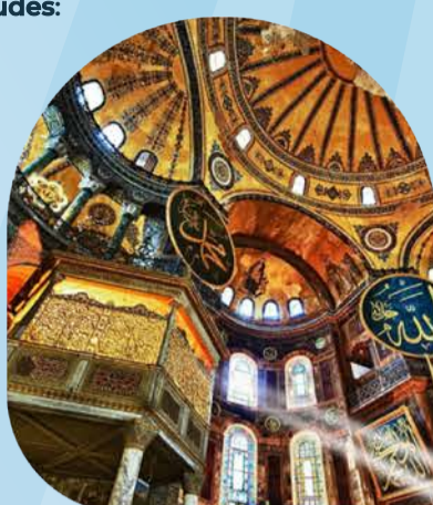
Hagia Sophia Mosque