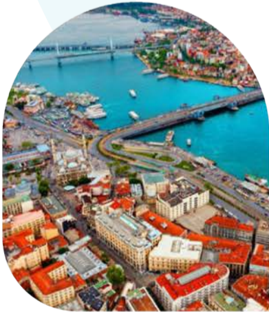
Boat trip Golden Horn Bay