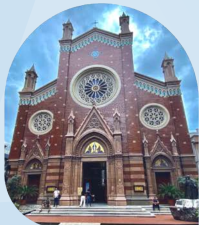
Church of St. Anthony of Padua