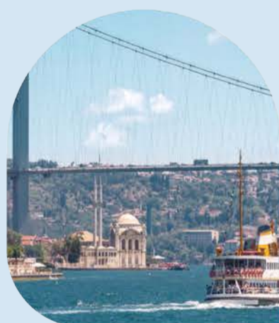
Bosphorus Boat Trip