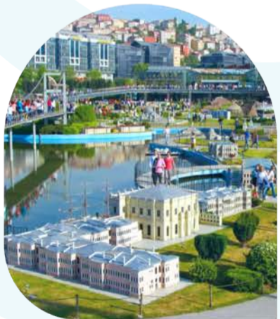
DINNER ON THE BOAT Miniaturk Park