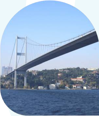
Bosphorus Bridge (view from the Bosphorus)