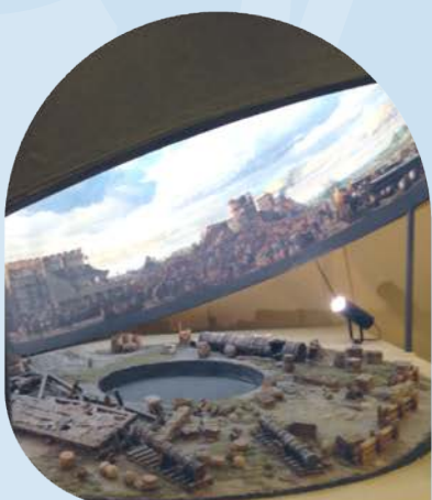
Museum Panorama 1453