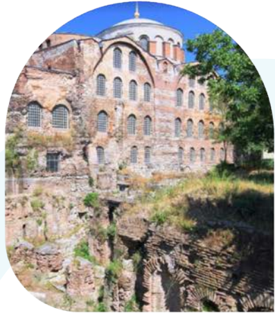
Church of Saint Irene