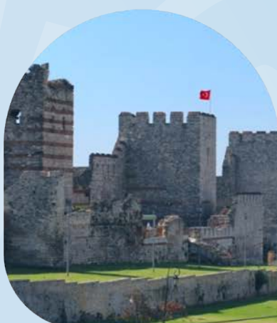
Walls of Constantinople

At the end of the tour there is an opportunity to go shopping.