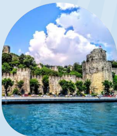
Rumeli Fortress (view from the Bosphorus)

At the end of the tour there is an opportunity to go shopping.