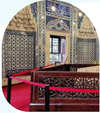
Tombs of Suleiman and Roksolana