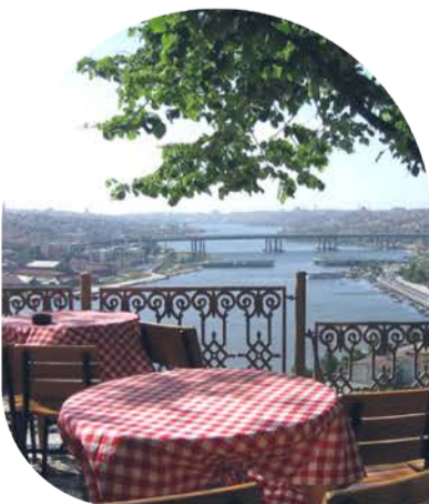
Pierre Loti Hill

At the end of the tour there is an opportunity to go shopping.