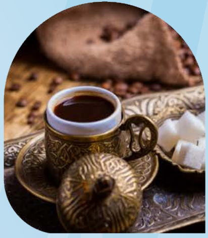
Turkish coffee and coffee brewin set