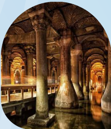
LUNCH Basilica Cistern