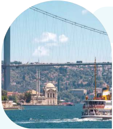
Bosphorus Boat Trip