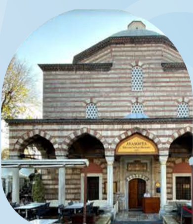
Hammam Hurrem Sultan (external view)