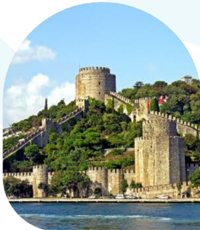
Rumeli Fortress (view from the Bosphorus)

At the end of the tour there is an opportunity to go shopping.